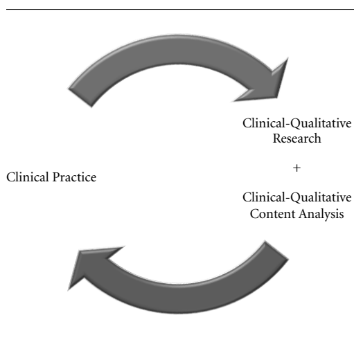
Figure 2. The Clinical-Qualitative Content Analysis based on clinical practice.

The results of these researches should favor multiprofessional health team and instrumentalize it to improve care for patients. The research question that leads to the clinical-qualitative study is part of the practice of health professionals in their clinical care and should therefore bring results to their practice, as shown in Figure 2.