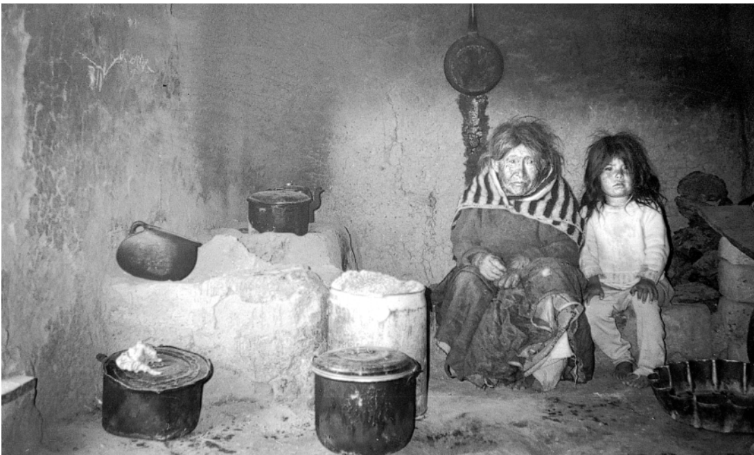
Fig. 1. A rural home in the highlands of Bolivia with walls blackened by smoke from an open wood fire

In general the types of fuel used become cleaner and more convenient, efficient and costly as people move up the energy ladder (6). Animal dung, on the lowest rung of this ladder, is succeeded by crop residues, wood, charcoal, kerosene, gas and electricity. People tend to move up the ladder as socio-economic conditions improve. Other sources of indoor air pollution in developing countries include smoke from nearby houses (6), the burning of forests, agricultural land and household waste, the use of kerosene lamps (7), and industrial and vehicle emissions. Indoor air pollution in the form of environmental tobacco smoke can be expected to increase in developing countries. It is worth noting that fires in open hearths and the smoke associated with them often have considerable practical value, for instance in insect control, lighting, the drying of food and fuel, and the flavouring of foods (3).