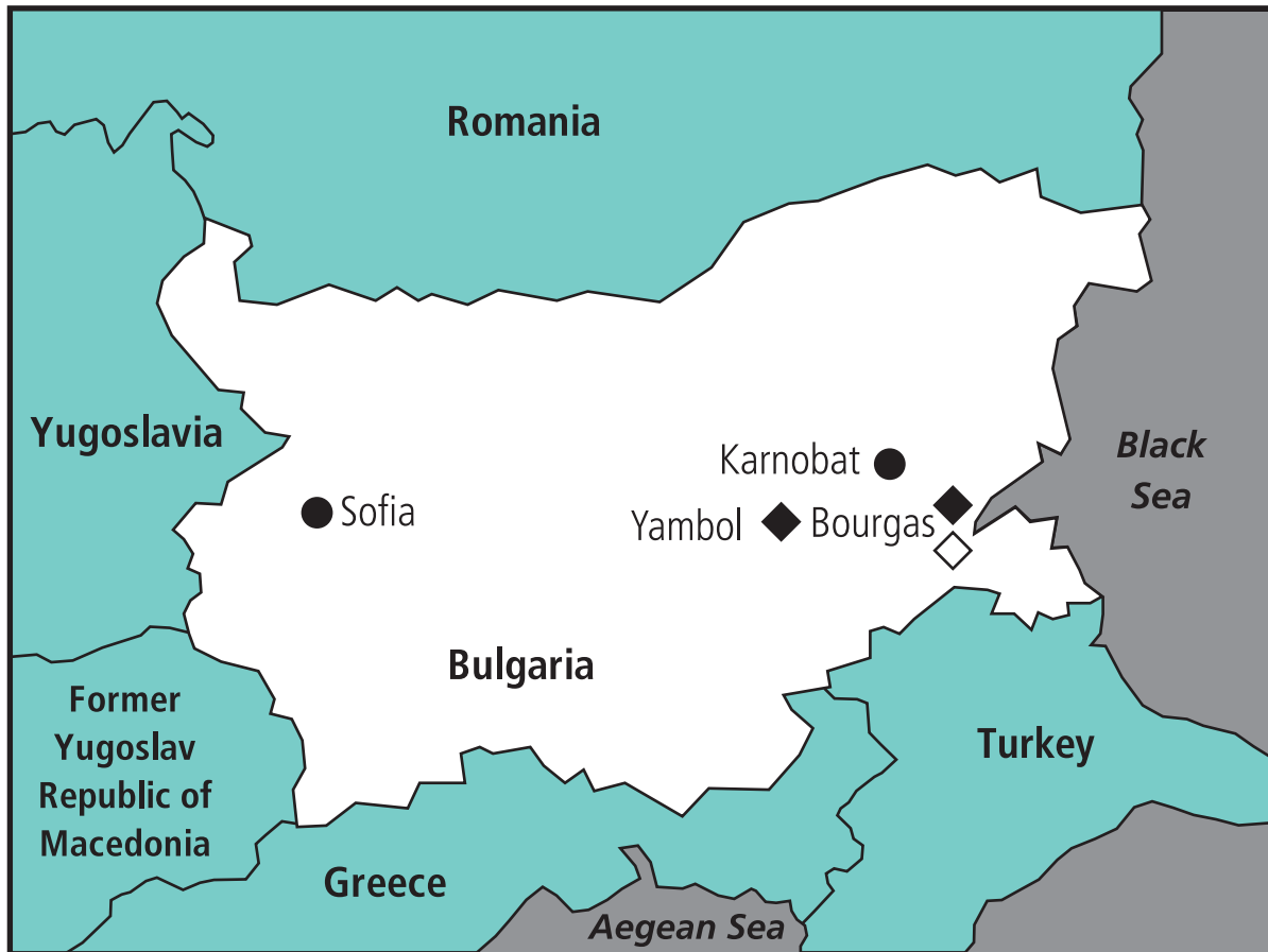
Fig. 2. Map of Bulgaria showing the residence of poliomyelitis cases positive at isolation for type 1 wild virus (◆), poliomyelitis case negative for wild virus isolation (◇), and asymptomatic carriers of type 1 wild poliovirus (●)