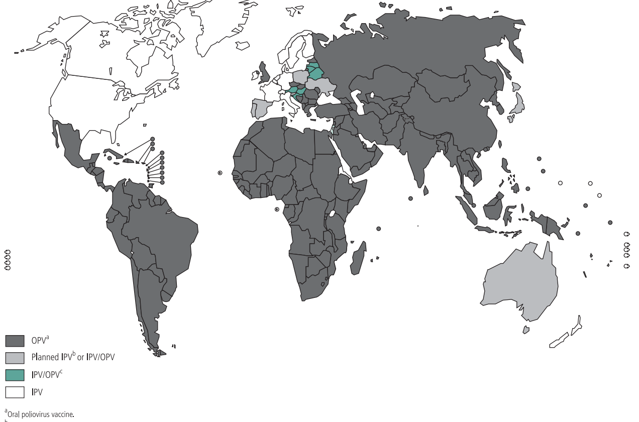
Fig. 1. Vaccines used in the routine polio vaccination schedules, by country, 2003

<sup>d</sup>Oral poliovirus vaccine. <sup>b</sup>lnactivated poliovirus vaccine. <sup>c</sup>Sequential IPV and OPV.