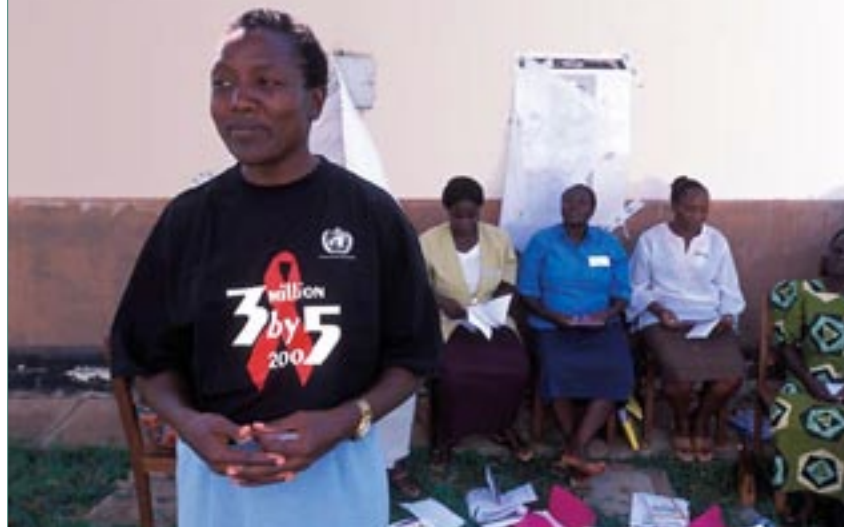
HIV-positive patients being trained in Uganda's Hoima district in 2004.