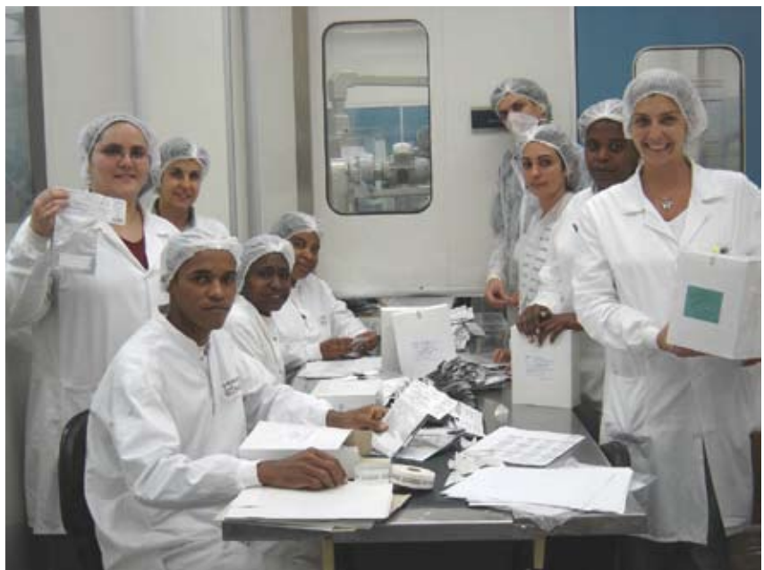
Members of the Brazilian team at Farmanguinhos.