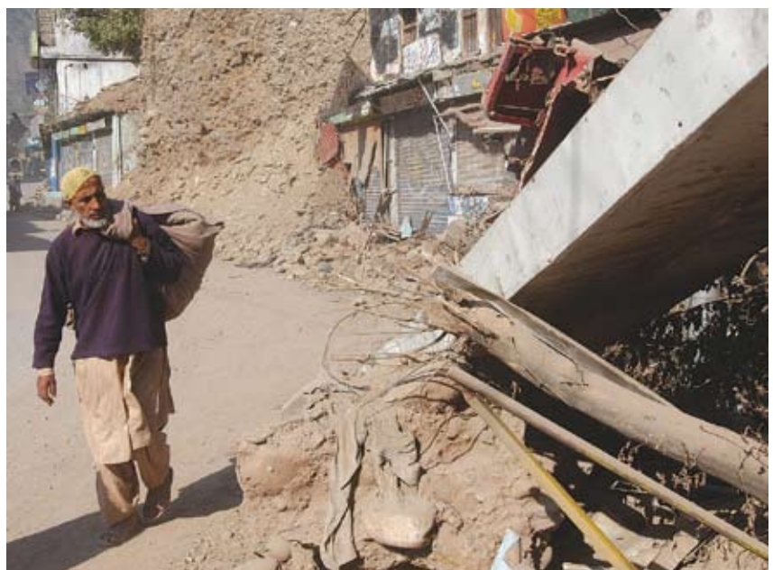
The Asian earthquake on 8 October killed 73 000 people and seriously injured 70 000 more. Three million people were left homeless and hundreds of thousands still lack the shelter they need to survive the winter.

Global warming as well as routine, cyclical climate changes are causing a higher number of strong hurricanes in the Caribbean, meteorologists say. Add to that the increasing number of people living in areas such as coastlines, in