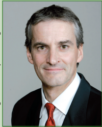
Jonas Gahr Støre

Jonas Gahr Støre earned his degree in political science at the Institut d'Études Politiques de Paris in France in 1985 after attending the Royal Norwegian Naval Academy. Støre started his career as a teaching fellow at Harvard Law School in 1986. Later that year, he started working as a researcher at the Norwegian School of Management. Since 1989, he has held a number of senior posts with the Norwegian government. From 1998 to 2000, Støre was chief of staff at the World Health Organization (WHO). From 2003 to 2005, he was secretary-general of the Norwegian Red Cross. In 2005 he became Norway's minister of foreign affairs.