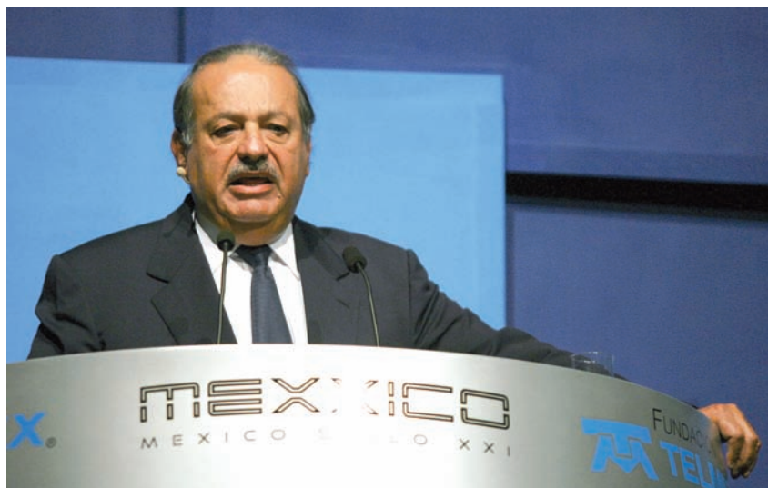
Mexican billionaire Carlos Slim Helú has invested US$ 500 million to establish his new health institute.

“The operating model is not that of a reactive institution that receives proposals,” said Julio Frenk. “It’s rather one of a proactive institution that has its own internal people carry out prospective analyses, define an agenda ... actively pick partners.”