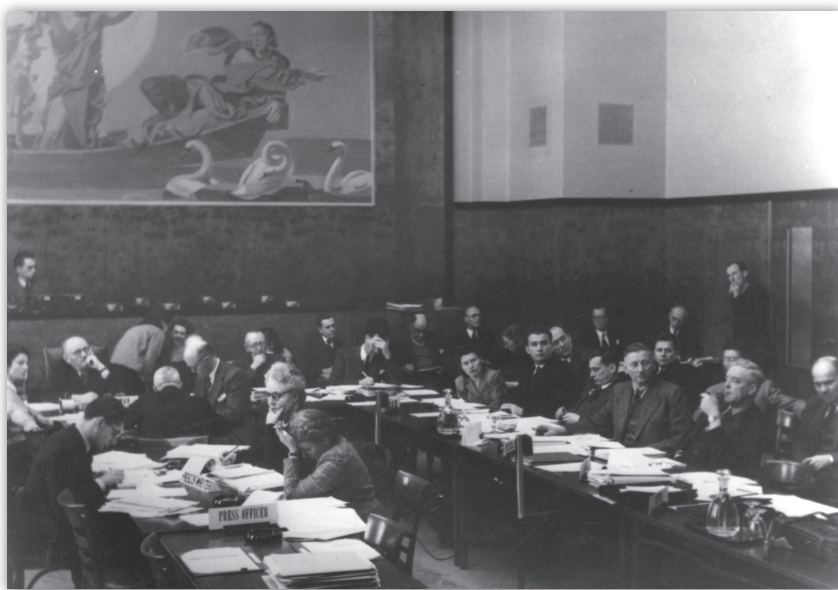
The Interim Commission, which was charged with establishing the United Nations health agency that eventually became WHO, discussed the possibility of publishing a journal to promote its work several times at meetings from 1946 to 1948.