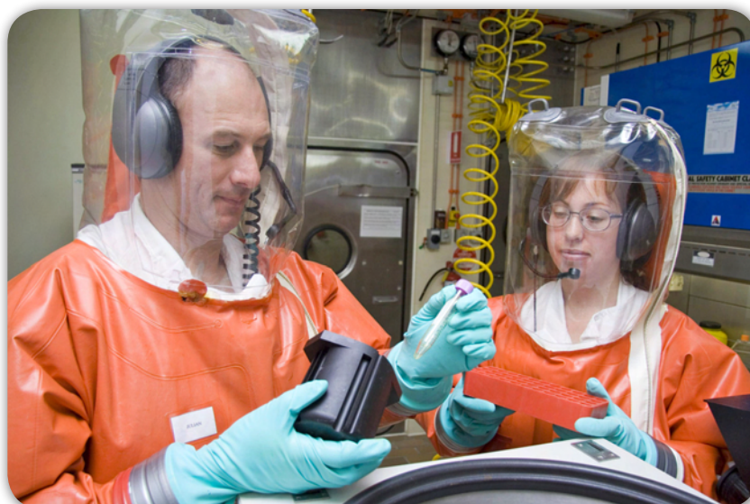
Scientists clad in protective clothing while working with dangerous animal pathogens at the Australian Animal Health Laboratory.

“Twenty years ago samples from an Ebola outbreak were all sent to the USA and Europe for testing, but that doesn’t help clinicians in the field to triage cases. In the past seven years or so, with CDC and the National