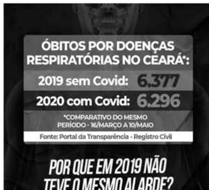
Figure 4. Notification of data distortions on deaths in Brazil received by Eu Fiscalizo between March 17 and April 10.

Com isso só temos duas conclusões: ou ano passado as vidas eram menos importantes que as desse ano, ou, estão usando essas mortes como arma política em ano de eleição.