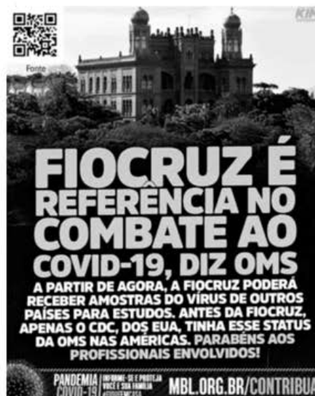
Figure 3. Notification of the fake fundraising campaign received by Eu Fiscalizo between March 17 and April 10.