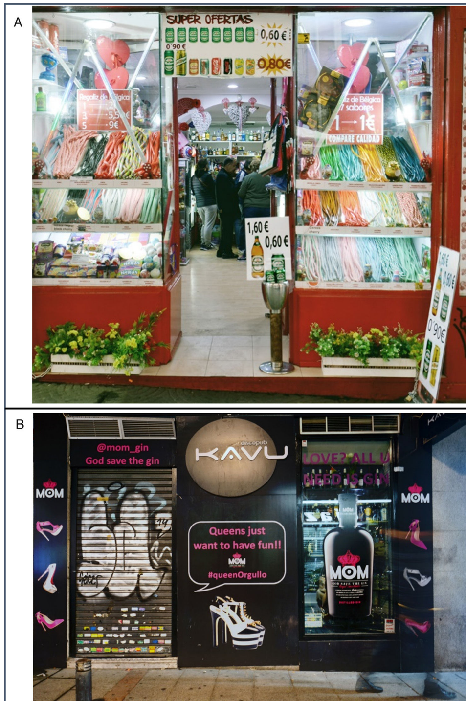
Figure 1. Availability and promotion associated to alcohol retail outlets. A) Availability of alcohol at relatively low prices in convenience stores is common, including in central areas and places popular with tourists such as the Plaza Mayor in Madrid. B) The alcohol industry circumvent existing regulations to promote its products using visible windows in the alcohol retail outlets.

consumption of 9.5 l of pure alcohol per capita, traditionally part of the wine growing culture, and a major tourist destination. 12