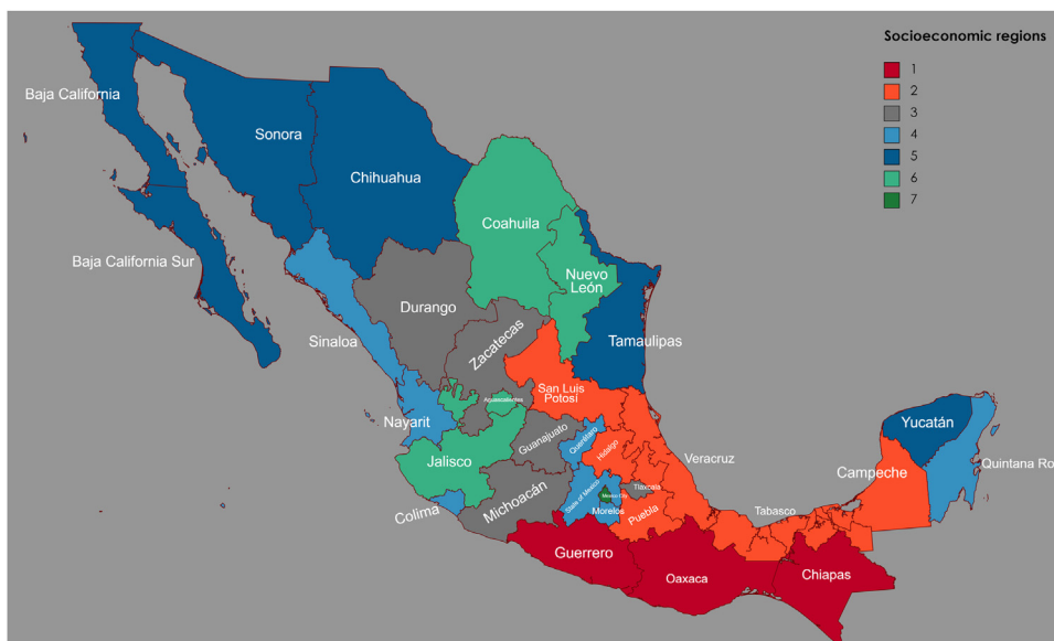
Figure 1. Geographic distribution of the socioeconomic regions of Mexico.

23% by 2050. 8 The consequences of this transition probably will be an increase in prevalence and mortality due to some diseases such as PD. Concerning the prevalence of PD in Mexico, previous studies had reported an overall incidence rate of 37.92/100,000 (incidence density of 9.48/100,000 person-years) for the 2014–2017 period, but when stratified by age, in the ≥ 65 population it was 313.94/100,000. The incidence rate was higher in men than in women (42.22 vs. 34.78/100,000, respectively). 9