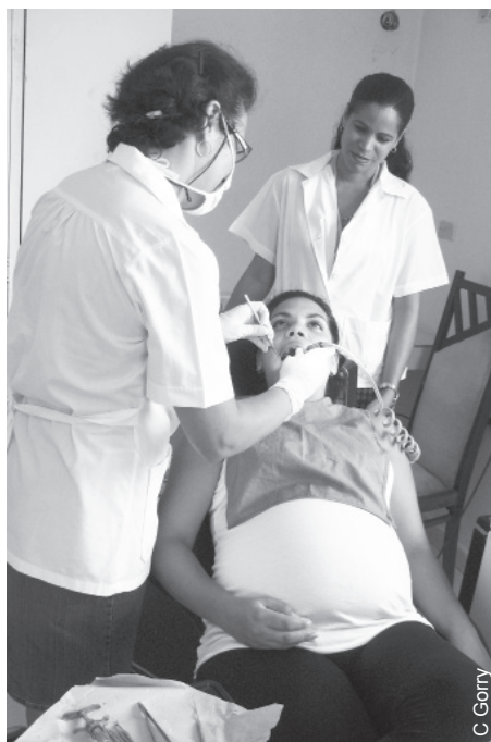
Maternity home dental services.

A series of assessments and exams are conducted upon admission, including a full dental check up. This is important, since maternal oral infections have shown to be a reliable predictor of low birthweight.[8] Because getting Cubans into a dental chair can be like pulling teeth, maternity home dentists not only treat infections, but also fill cavities, do routine cleanings, and provide other necessary dental services for the duration of the woman's stay.