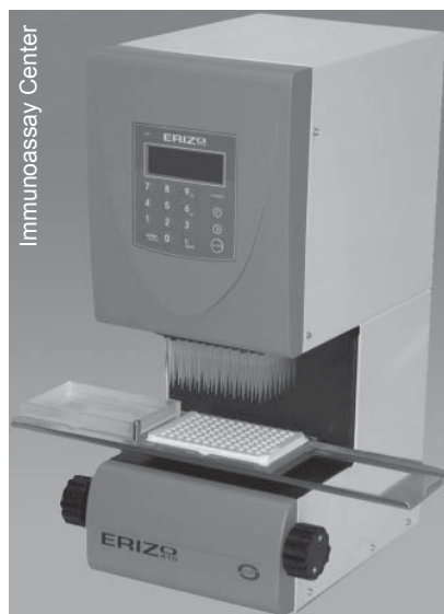
Multichannel pipettes dispensing reagents and specimens manufactured in Cuba help provide sustainability to the health system.

some half a dozen countries, including Brazil, Argentina, China and Mexico.[9] The Cuban approach—locating laboratories near patients, CIE certification courses for technicians, strategically-placed servicing and maintenance branches—is adapted to each site. The most popular products internationally are the SUMASensor, reagents and an innovative cytology kit—one of CIE's newest products—developed jointly with the National Cancer Control Unit and the Cervical Cancer Early Diagnosis Program. International demand for CIE technologies and instruments (all of which undergo external evaluations and adhere to international quality control and certification standards) is growing—so much so that CIE is currently working at double capacity and is expanding its physical plant to keep pace.