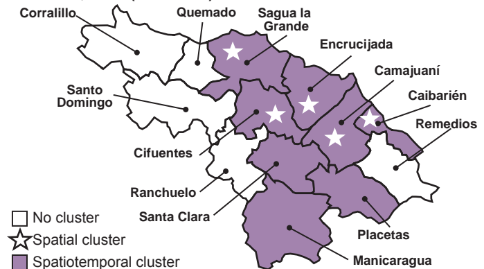
Figure 2: Spatial and spatiotemporal lung cancer case fatality clusters in Villa Clara, Cuba (2004–2009)