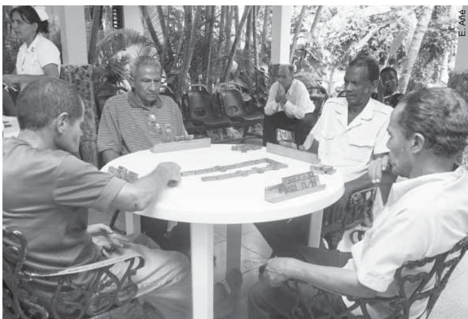
Guanabacoa psychiatric day hospital.