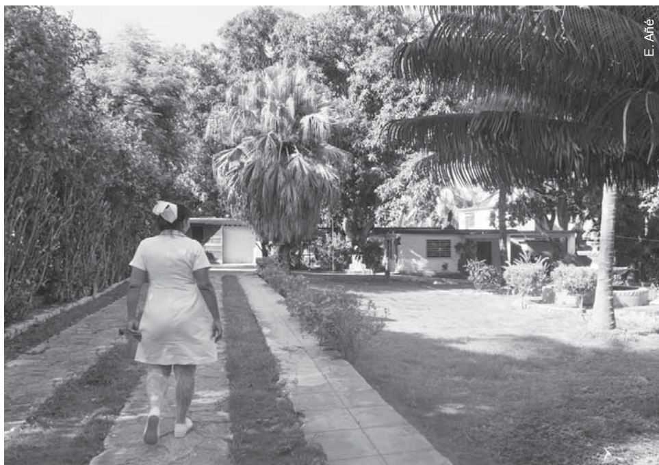
Guanabacoa Community Mental Health Center