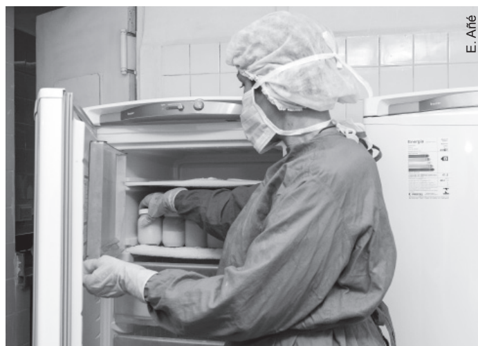
Milk donations frozen in Pinar del Río’s breast milk bank.

method,[9] classification (there are over a dozen types of breast milk, each with different properties), and a last microbiological analysis to assess whether the milk is certified for distribution. The banks operate 8–12 hours a day (the Guantánamo bank is 24 hours) and the milk is processed once or twice a week, depending on volume of donations, demand and the most rational use of resources for each hospital. All breast milk banks in Cuba are located next to the hospital’s neonatology wards and are designed for a seamless flow between intake, processing, storage and distribution of donated milk.[10]