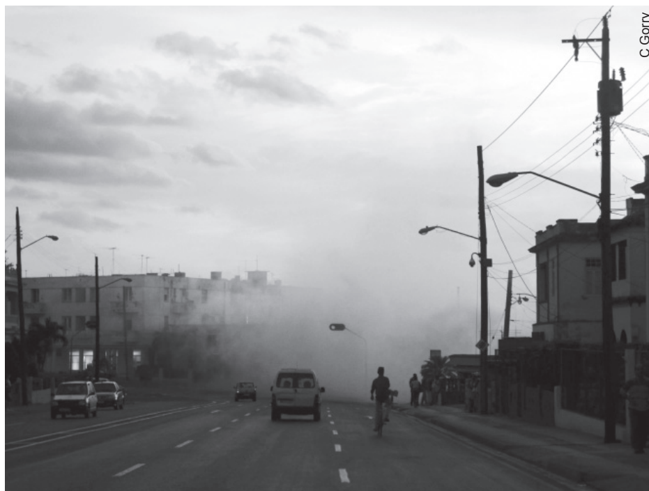
Fumigating at-risk neighborhoods in Havana

In order to maintain effective surveillance and control over time as lower risk perception and fumigation fatigue set in, two new plans are being set in motion: the Phase II Plan and the Sustainability Plan. The first is designed to kill larvae before they hatch by treating standing water and spraying interior walls, exterior areas and water tanks with larvicide. Cuban industrial and biotechnology sectors have joined the fight as well: locally-produced repellent and biolarvicide drops for treating standing and stored water are now sold in stores and pharmacies, and in-home foggers will be available for purchase soon.