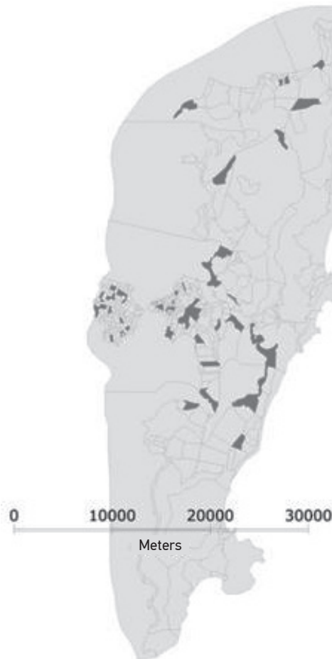
Figure 2. Selected sectors in a Florianópolis map.

Once the tracts to be visited were defined, it was necessary to obtain the list of households that composed them. Such list is updated every 10 years by the IBGE for the national census. In case a survey is conducted in the years that immediately follow the census, the updated list will be extremely useful, and it can be easily obtained from the institute. As the EpiFloripa was carried out in 2009, the available lists were already outdated (year 2000), and it was necessary, then, to update the locations and the quantity of households in each tract. In regions of great urban mobility and territorial occupation, it is important to update the amount of households even in years after the census. To carry out the procedure of “beating the tract”, that is, to update the households in each unit, we had to resort to the IBGE in order to obtain the maps that marked the borders of the census tracts. These maps