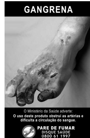
FIGURE 1. TYPES OF PICTORIAL-BASED WARNING LABELS

the Uruguayan's cigarette packages include a website address where smokers can get information on smoking cessation (Figure 1). Honduras and Trinidad & Tobago have not specified the message content of their HWLs as of August, 2010. Despite recommendations of Article 11's Guidelines, as of August 2010, no countries in LAC had adopted non-health messages such as the adverse