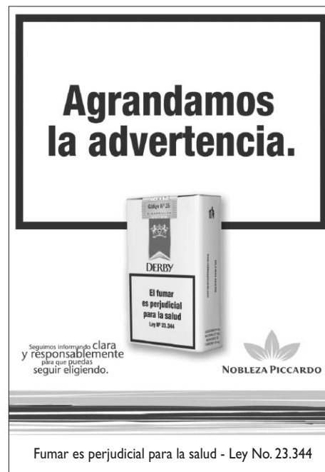
FIGURE 2. BAT ARGENTINA CAMPAIGN IN BILLBOARDS (2005)

In 2005, BAT Argentina increased the size (up to 30% in the back) of the weak and unspecific only-text warning label "Fumar es perjudicial para la salud" [Smoking is harmful to health]. The company launched a campaign on billboards claiming "We increased the [health] warning [label]. We continue to inform clearly and responsibly so you can continue to choose. Nobleza Piccardo" (Figure 2). 65 Similar measures were developed by BAT in Colombia, 66 Honduras, 67,68 Costa Rica, 69 and Trinidad & Tobago. 70