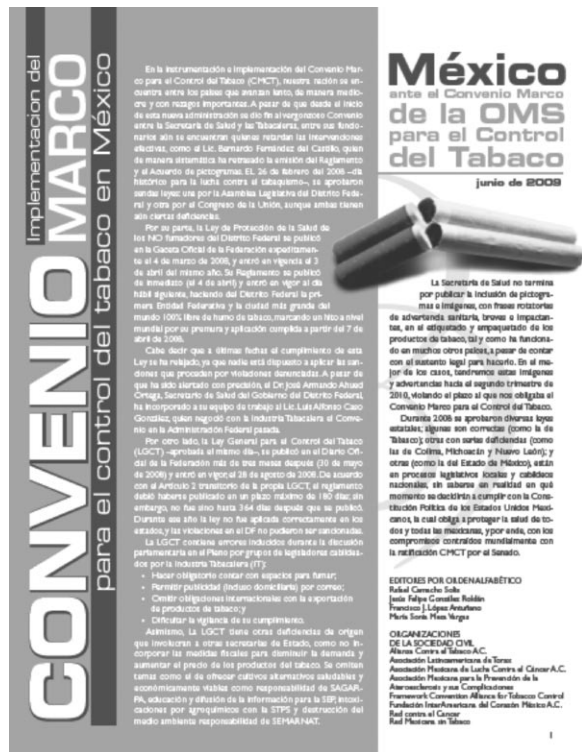
FIGURE 1. MEXICAN CIVIL SOCIETY SHADOW REPORT ON THE IMPLEMENTATION OF THE FCTC

activity, learn how to monitor air quality, or respond to economic questions.