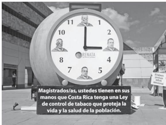
FIGURE 2. IN SEPTEMBER 2011, RENATA PLACED A LARGE CLOCK INSIDE THE LEGISLATIVE ASSEMBLY TO SHOW LAWMAKERS THAT EVERY 2 HOURS 40 MINUTES A COSTA RICAN DIED FROM TOBACCO. 26 THE CAPTION READS, “JUDGES, YOU HAVE IN YOUR HANDS A COSTA RICAN TOBACCO CONTROL LAW THAT PROTECTS THE LIFE AND HEALTH OF THE POPULATION.” [TRANSLATED BY AUTHOR]

tobacco taxes and penalties for non-compliance, and required pictorial HWLs covering 50% of the front and back of the package (table I).